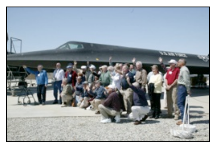
Former Pratt & Whitney employees visiting the Palmdale Air Park in 2005