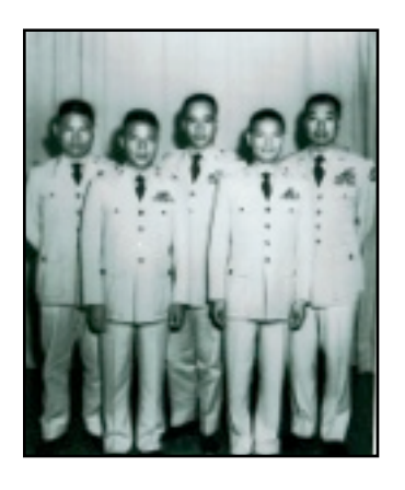
The Roadrunners were sadden at the loss of Col. "Gimo" Yang, one of the first six Blackcap U-2 pilots in Taiwan. <u>More about Colonel Yang</u>