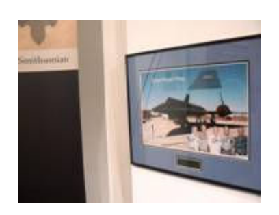
Yo! Roadrunners: Note the plaque being displayed at the Atomic Museum in Las Vegas. It is nicely engraved to identify the pilots and the A-12 article.